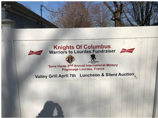
2 nd Annual Warriors to Lourdes Fundraiser was held April 7 th at the Valley Grill.