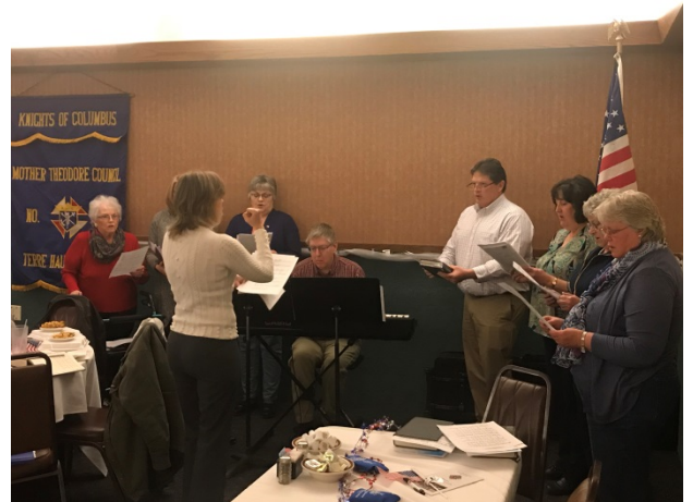
The St. Joseph University Parish Choir Provided the Entertainment at the Fundraiser.